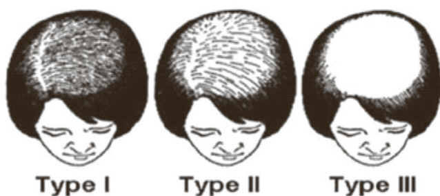
Figure 1. Classification of female androgenic alopecia on the Ludwig scale.

Type III: Within the frontoparietal area, hair is completely lost.