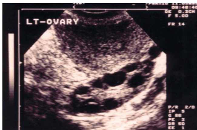
Figure 2. Echogram. The necklace is an ultrasound sign of PCOS.

The absence of polycystic ovaries on ultrasound does not rule out PCOS.